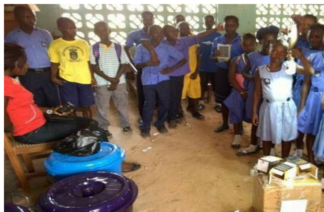
Advertising the lamps to the school children at the Ngepay primary school