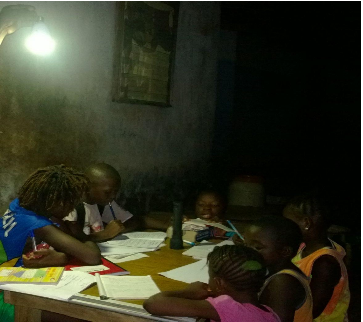
Children doing their home works

In conclusion, the lack of sufficient money to successfully support the solar kiosk for the more than 5,000 inhabitants of the Sherbro Island is a big risk undertaken for this project.