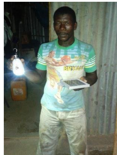
Kamasu (fisherman) for fishing